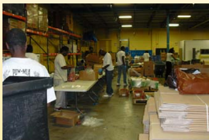
Second Chance Center participants provide needed assistance at Harvesters.