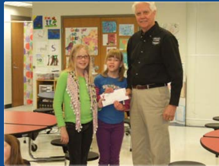
Two fourth grade students wanted SAFE as the recipient of their after school program fundraiser.

something to help firemen and their families. What a great contribution!